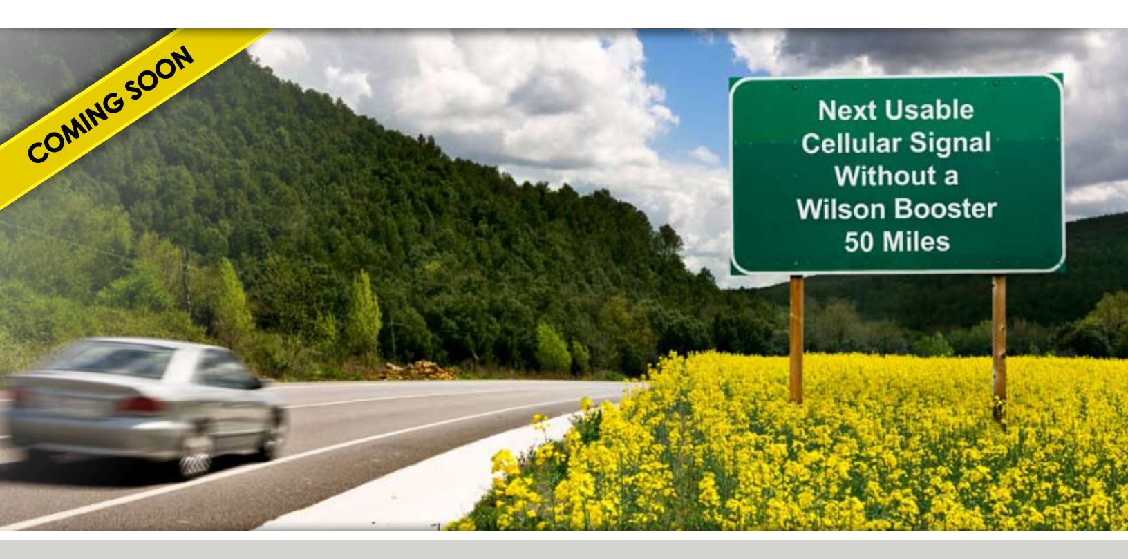
The Sleek 4G-V<sup>™</sup> – Get peak cellular performance in your vehicle for all phones including Verizon Wireless® LTE devices